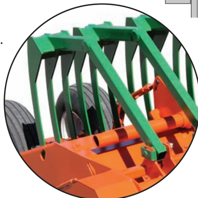
Triple rake option.